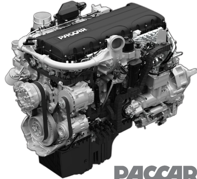
PACCAR MX-11 Powered By Quality

PACCAR's 50 years of diesel engine development and manufacturing expertise has established the company as one of the leading diesel engine manufacturers in the world. PACCAR engines have accumulated over 50 million miles of field testing — in the most severe of conditions in North America — resulting in an engine durability B10 design life of 1,000,000 miles. This level of quality and durability increases the time before a major overhaul is needed — resulting in exceptionally low life cycle costs. PACCAR Engines are built in Columbus, Mississippi at a state-of-the-art engine manufacturing, machining, and assembly facility.