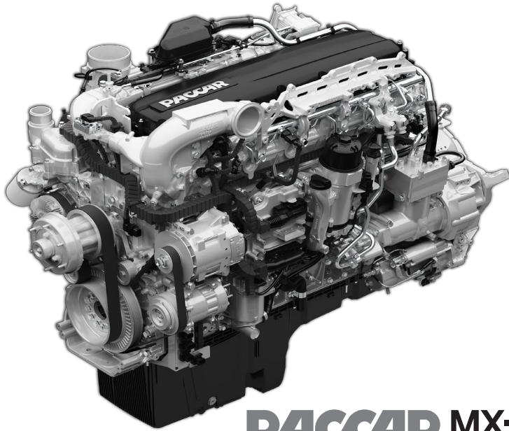
PACCAR MX-13 Powered By Quality